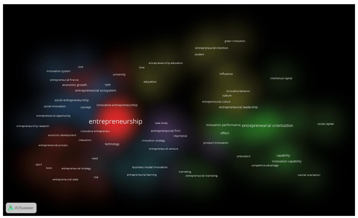
Figure 3. Cluster Mapping

We studied the cluster analysis results in Figure 3, presenting an overview of the identified clusters, total items, and keywords that appear most frequently within each cluster. The discussion will focus on the