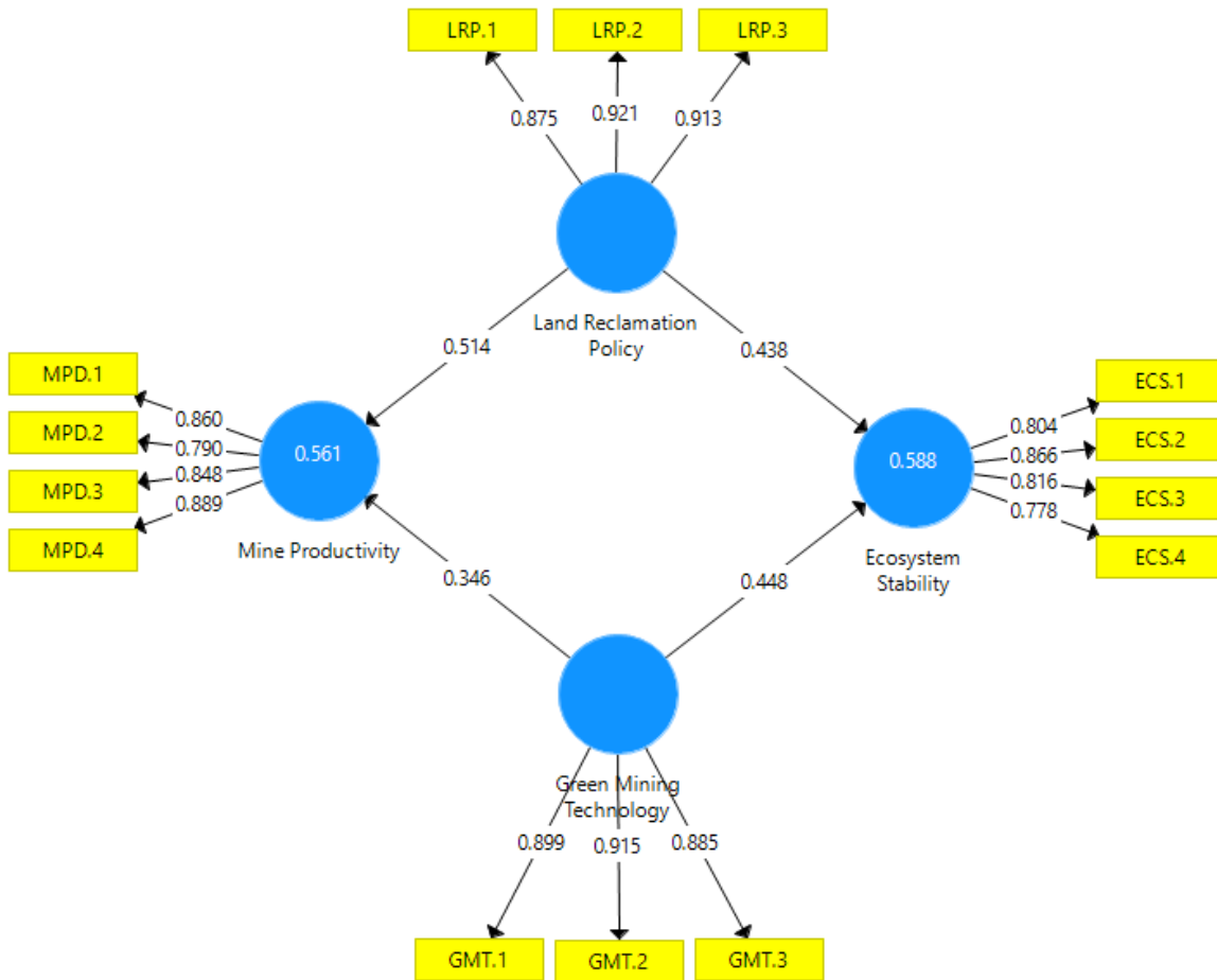
Figure 2. Model Results

Source: Data Processed by Researchers, 2024