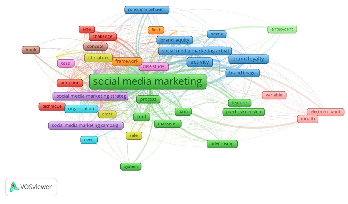
Figure 1. Network Visualization Map of Keywords

To answer the first purpose of this paper about how are social entrepreneurship articles classified using VosViewer software, through creating a map based on text data using the title and abstract fields, with the full counting method there are 3706 terms found. With a minimum number of occurrences of a term of 10 times, 111 thresholds were found. However, for each of the 111 terms, a relevance score will be calculated. Based on this score, the most relevant terms will be selected automatically by default 60%, so we get the 67 most appropriate words. However, the verification process still has to be done manually by eliminating unrelated words, such as editorial, sample, abstract, and others. Thus, the total words that can be included in making a map are 63 words.