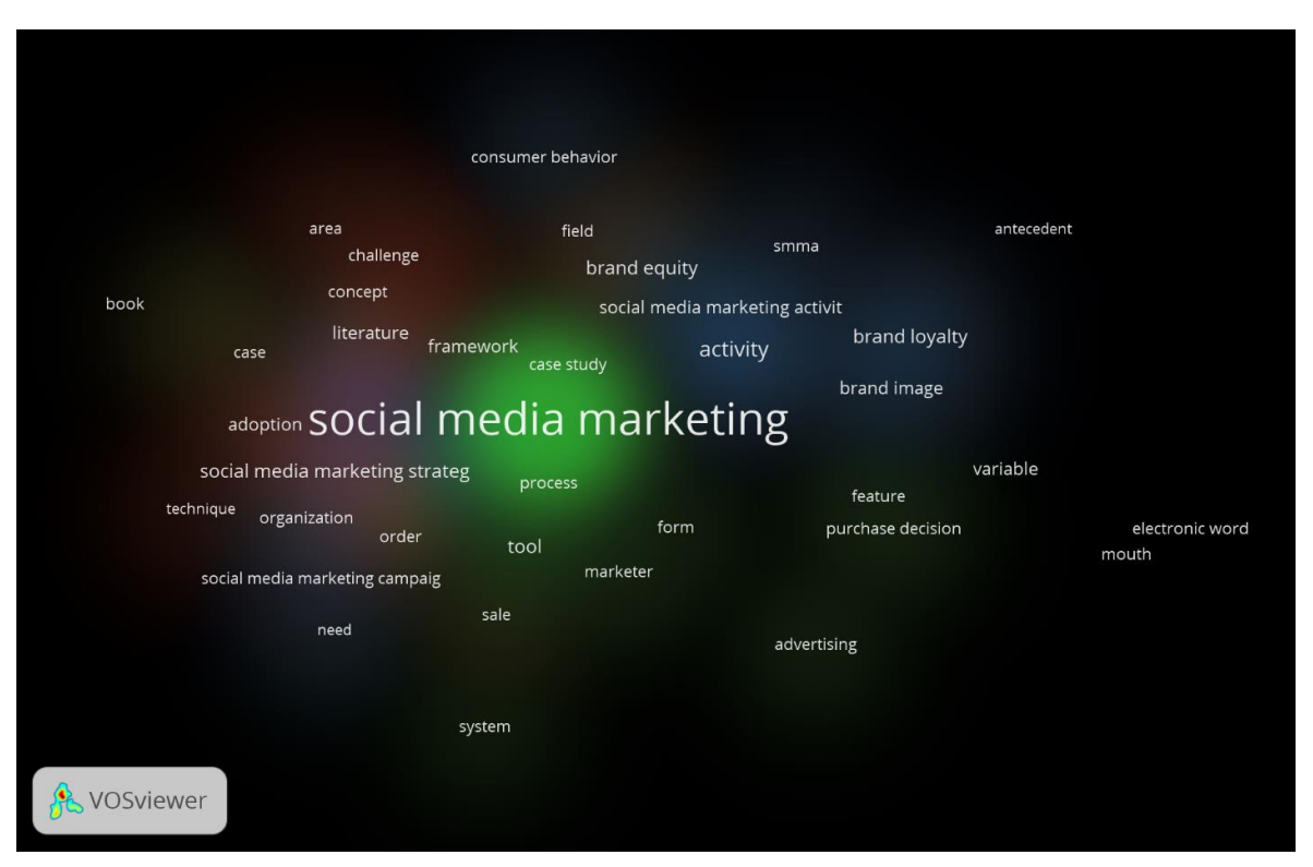
Figure 2. Density Visualization Map of Keywords

There is a cluster of results of this mapping that appears at least in the keyword, namely cluster 6. This cluster covers topics on marketing and economics. In addition, some words rarely appear in keywords, such as, in each as municipal finance management act or sustainable development. That is, there are still research gaps that are very likely to become trends in the future, which are certainly adjusted to current and future world conditions. From the researchers' side, there are also six clusters, as presented in Figure 3.