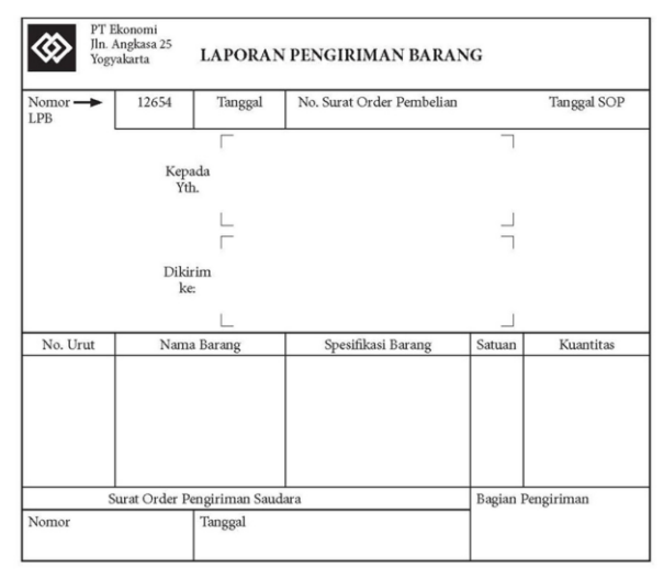
Figure 2. Goods Delivery Report Document