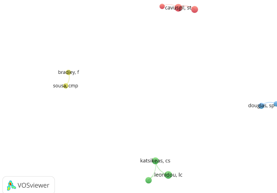
Figure 3. Author Visualization