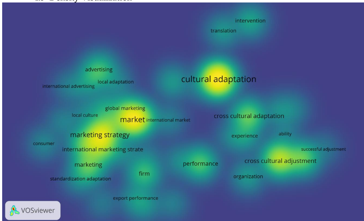
Figure 4. Density Visualization