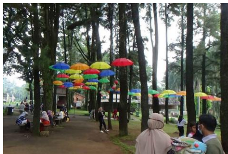
Figure 1. Studio Alam TVRI Depok

Studio Alam TVRI is open almost every day to visit (except Monday), with operating hours from 08.00 to 16.00 WIB or 8AM to 4PM. The ticket price is very affordable at only Rp5,000 per person, but there is an additional fee charged if you bring a vehicle. Studio Alam TVRI is one of the popular cheap tourist attractions in Depok. This place has also been used to make films such as ACI (I Love Indonesia) to the horror films Jailangkung 1, 2 and 3 [25].