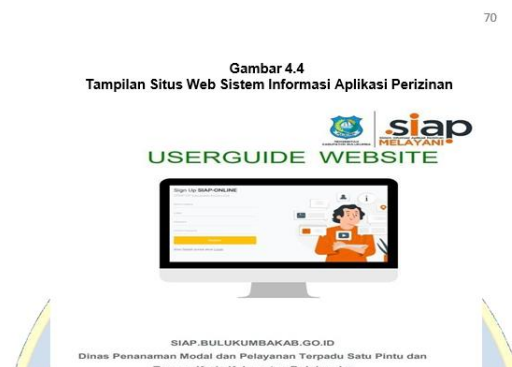
Figure 4.4. Website Display Application Information System Permissions

The licensing flow after the SIAP application, applicants no longer need to come to the office, with a relatively fast licensing service time, which is for 1 day and can be completed no later than 5 working days since the application and requirements are received correctly, complete and have been held meetings and location checks.