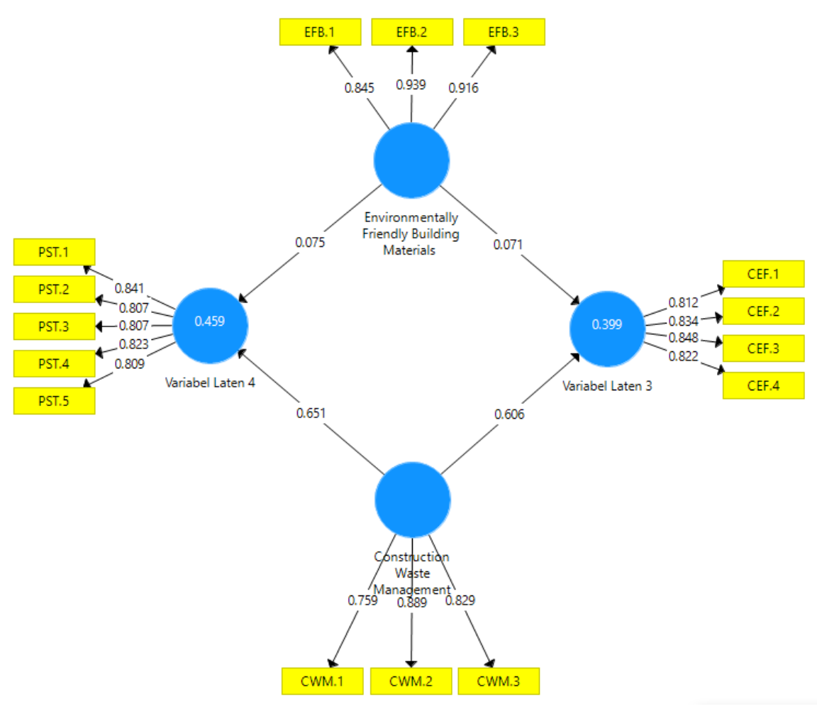
Figure 1. Model Results

with AVE values greater than their correlations with other constructs. Overall, the Fornell-Larcker criterion confirms that all constructs in the model have satisfactory discriminant validity.